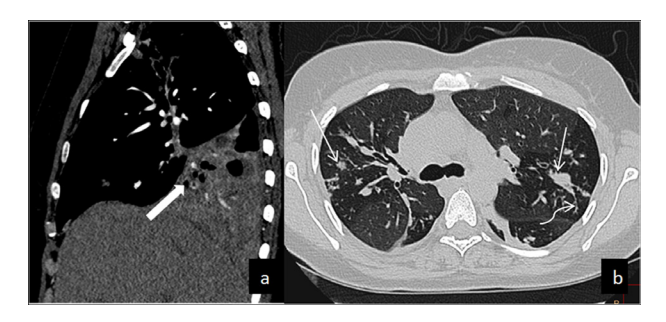
Figure 1. (a) Sagital CECT images showing consolidation of right lower lobe with cavitations (block arrow). (b) Axial MDCT in lung window showing multiple nodules in bilateral upper lobes (straight arrows). Note the tree in bud appearance in posterior segment of left upper lobe (curved arrow).