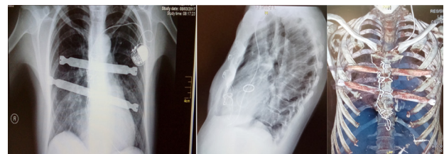
Figure 3. Postoperative Rx and CT images.

In the past more invasive procedures have also been described, such as the sternal turnover, eversion in a trapdoor fashion, turnover with internal thoracic-vessel presentation or even a modified Nuss procedure. 1,3,5 These techniques offer excellent operative exposure but they are associated with a high percentage of wound infection or