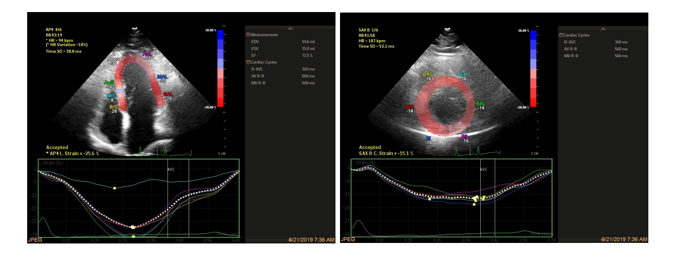
Figure 1. Detection of the endocardial and epicardial border throughout the cardiac cycle (Left: Apical 4 chamber view, right: Parasternal midvantricular short axis view).