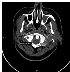
Figure 3. Axial image shows RVA occlusion.

occlusions which might occur due to hyperrotation, hyperextension, cervical traction or cervical fracture dislocation. Atlanto-occipital and atlanto-axial joints, and fifth and sixth cervical vertebrae are common sites for combined fracture dislocation and compression. Nevertheless, atlanto-occipital and atlanto-axial joints, and foramen magnum are common sites for arterial stenosis and/or occlusion caused by hyperrotation or hyperextension. Ischemic syndrome of the brain stem or spinal cord are conditions which might rise following bilateral obstruction of vertebral arteries, obstruction of a single vertebral artery combined with inadequate flow in the counterpart artery and finally, embolism, atresia or thrombosis of the posterior communicating or nearby collateral arteries. Rapid excessive rotatory movement or hyperextension of the head with no associated fracture or dislocation are scenarios following which ischemic brain stem or spinal cord syndromes might be seen. 6 Although there is no documented decisive evidence for