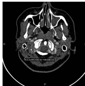
Figure 2. Axial image shows RVA narrowing and irregularity.