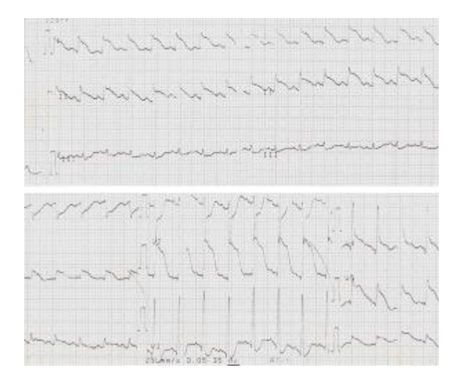
Fig 1- Electrocardiogram of the patient

serum troponin level was elevated to10 ng/ml (Normal up to 8 ng/ml). Coronary angiography was done which revealed no obstructive coronary lesions (Figure 2A and 2B). The left ventriculogram demonstrated apical ballooning with an appearance of Tako-Tsubo cardiomyopathy and an ejection fraction of 20% (Figure 2C). Conservative medical treatment recommended with inotropic agents, angiotancin converting enzyme inhibitor, ASA and anticoagulation. Yet the patient developed shock and remained unstable on high doses of epinephrine, vasopressin, dobutamine, dopamine, norepinephrine. Unfortunately she died three days after admission due to sepsis.