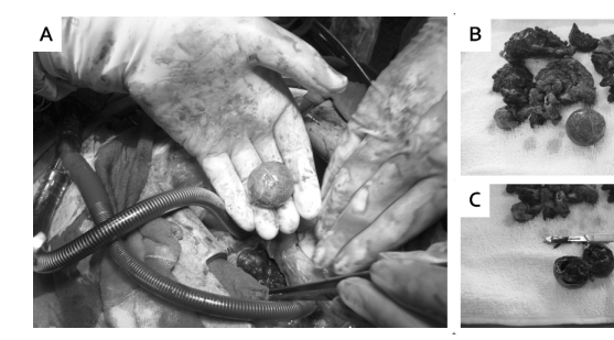
Figure 2. A. surgical extraction of the ball-like mass; B. segments of excised tumurous tissue and the ball-like mass; C. split balllike mass, revealing its thrombotic nature.