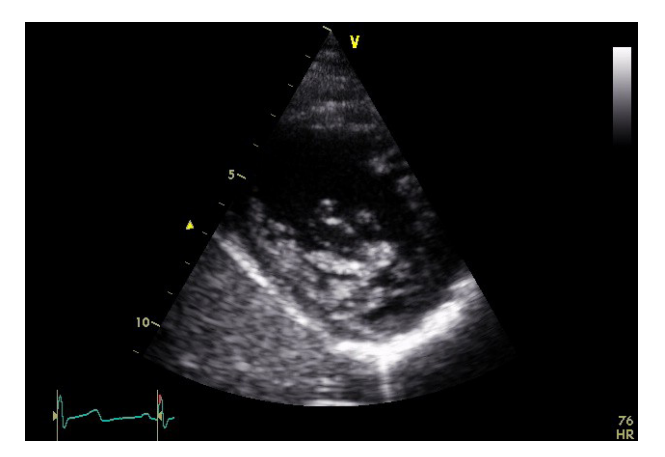
Figure 2. Parasternal short axis view on mid- papillary level shows a single postromedial muscle.

patients.<sup>3,4</sup> Adults with PMV experience modest defects that do not need for echocardiography and may lead to under diagnosis of the anomaly.