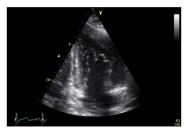
Figure 3. Apical two chamber view demonstrates typical parachute appearance of mitral chordae

Conservative surgical treatment may consist of either chordal fenestration or papillary muscle splitting, with or without commissurotomy.<sup>13</sup> The prognosis is usual-