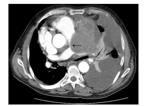
Figure 1. Chest CT scan with IV contrast. Black arrow pointing to pressure effect of hematoma on main and left pulmonary artery.

The patient had a preoperative selective coronary angiography via right radial artery which was normal. He underwent left thoracotomy via femorofemoral bypass. A large pseudoaneurysm of distal aortic arch was detected (Figure 3). Large hematoma was evacuated from the mediastinum and the aortic wall was repaired with a patch.