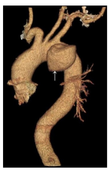
Figure 2. CT angiography of aorta. White arrow pointing to pseudoaneurysm of aorta distal to subclavian origin.

Figure 1. Chest CT scan with IV contrast. Black arrow pointing to pressure effect of hematoma on main and left pulmonary artery.