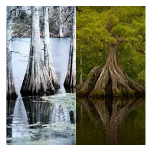
Figure 1. Cypress Tree Roots : Note the multiple roots arise off from the floor of the swamp as separate and distinct roots but eventually coalesce to form the trunk of the cypress tree.

overlooked on gross anatomy perhaps because the heart is in a contracture (systolic) state after the death masking its' formation. Similarly, in the operative suite, such is not recognized during induced cardiac arrest. However, CMR with its high spatial and temporal resolution allows in-vivo appreciation of such a model, which has not been evidently described before based on autopsy findings.