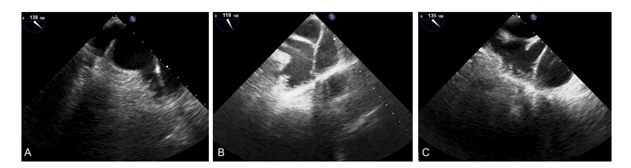
Figure 2. Three morphologies of LAA, including (A) wind sock, (B) broccoli, and (C) chicken wing.