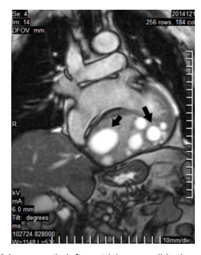
Figure 2. A large cystic left ventricle mass (black arrow) seen on the cardiac MR.