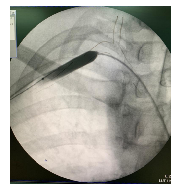
Figure 1. Proximal control of right subclavian artery injury with active extravasation on angiography.

In a hybrid operating room and under general anesthesia, operations were conducted in supine position. Supraclavicular, infraclavicular, trapdoor or anterolateral thoracotomy incisions were used depending on the anatomical location of the injury. Arterial injuries were repaired by arteriorrhaphy, interposition by reverse saphenous vein graft or ligature and subsequent bypass. Proximal balloon control was conducted through access from common femoral artery or brachial artery via a 5F or 6F sheath. In femoral artery access, crossing to subclavian artery was conducted by Simmons and vertebral catheters with the guide of hydrophilic 0.035 guidewire. In brachial artery access, the contrast agent was administered from the sheath directly. Figure 1 shows arteriography revealed extravasation of subclavian artery injury. Six patients had the technique illustrated in Figure 2 to establish proximal balloon control from femoral or brachial accesses and wire access into injured part of the subclavian artery. Bleeding