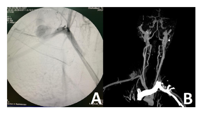
Figure 2. Right subclavian artery injury (A). Preoperative CT Angiography of injured right subclavian artery (B). Extravasation of the contrast material.

control was obtained through inflated balloon catheter by compressing the site of the injury to temporarily control the bleeding until surgical control and repair.