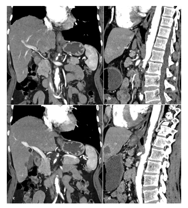
Figure 2. Coronal (a,b) and Sagittal (c,d) multiplanar reconstructed arterial phase CT images depict the true extent of penetrating atherosclerotic ulcers