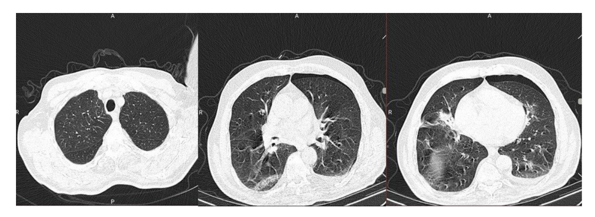
Figure 1. First Chest CT of the patient showing posterior-peripheral ground-glass opacities, with a thin radiolucent line presenting a small pneumothorax. The patient had minimal involvement in the apex of the lungs, and involvement was mostly observed in the bases

Early studies being reported from china showed that most patients infected with the novel coronavirus had conventional signs of viral pneumonia. However, as the virus spread, more scholars pointed out the rare complication of the infection, such as neurovascular and dermatologic involvement, and significant involvement