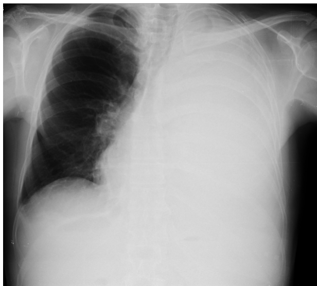
Figure 1. Chest X-ray before the first thoracentesis

We decided to perform an Abdominal Computed Tomography (CT): at the pancreatic body / tail transition,