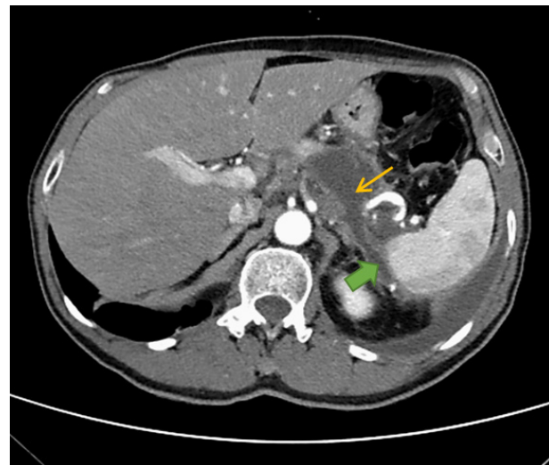
Figure 2. Abdominal Computed Tomography (CT) at the time of diagnosis, with evidence of pancreatic pseudocyst (thin yellow arrow) and one of the fistulous paths (full green arrow)

The importance of this case lies in the rarity of the event and presentation. The absence of symptoms (abdominal pain, nausea, vomiting, steatorrhea) of the probable primary event (acute pancreatitis) preceding chest pain makes it more peculiar. Therefore, it is not possible to specify the beginning of the process or the etiology of the probable acute pancreatitis that caused this complication (PPF). Although the most frequent causes (lithiasis, alcoholism and uncontrolled hypertriglyceridemia) have been excluded, it is difficult to define if pancreatitis was iatrogenic or not. One of the drugs possibly implicated, Empagliflozin (oral antidiabetic drug of the sodium-